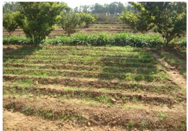
Napier grass (CO-3) planted on bunds