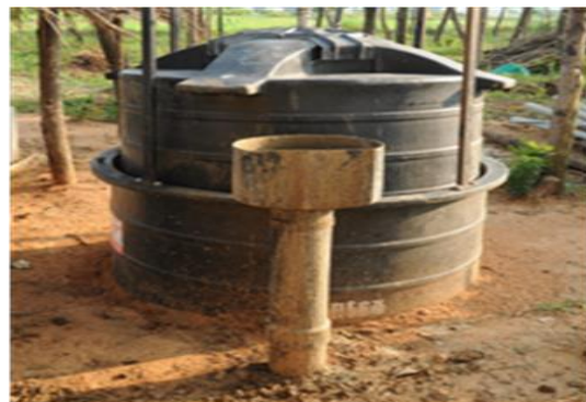
Portable Syntex Biogas Plant