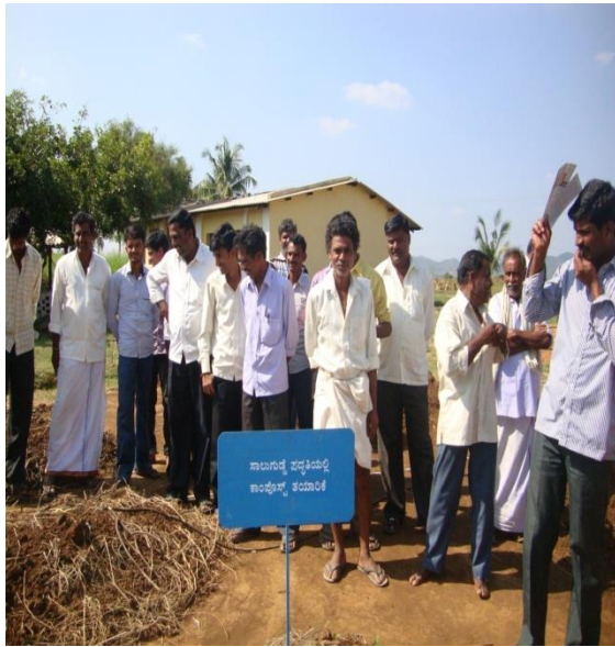
compost preparation at ZAHRS, Navile