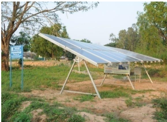
Solar operated pump