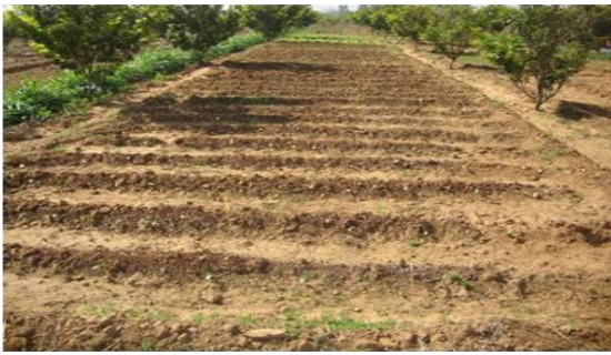
Kitchen garden fishpond