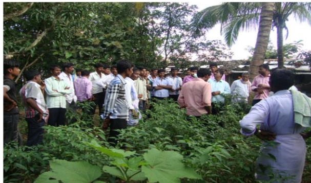
Farmers at BAIF, Surashettykoppa