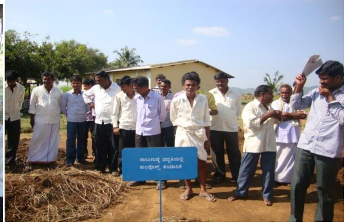
Farmers under training at Vermicompost unit and method demonstration on compost preparation at ZAHRS, Navile, Shimoga