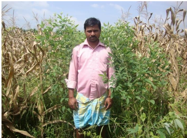
Red gram intercropping in maize in paired rows