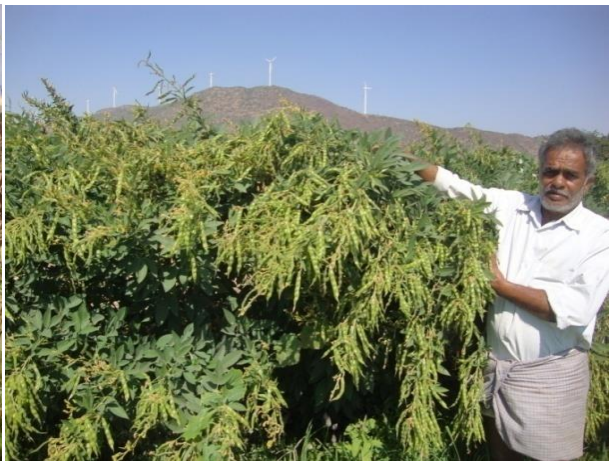
Good yield of BRG 2