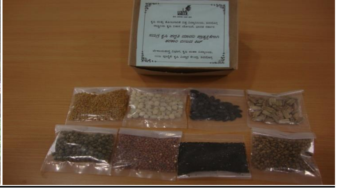
Greens in the kitchen garden, Azolla in the back ground Kitchen garden seed kit given to farmers