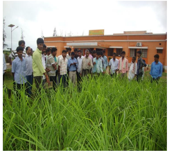
Farmers at IGFRI, Dharwad