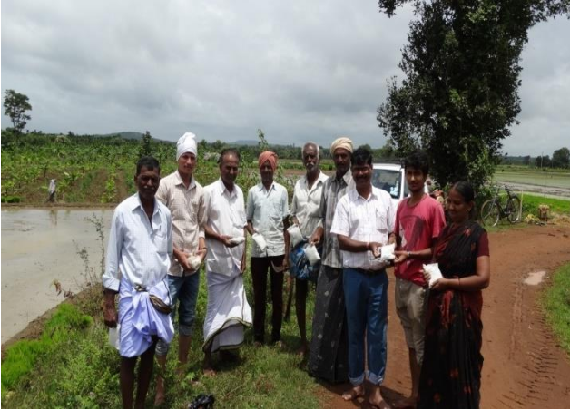
Distribution of biofertilizers