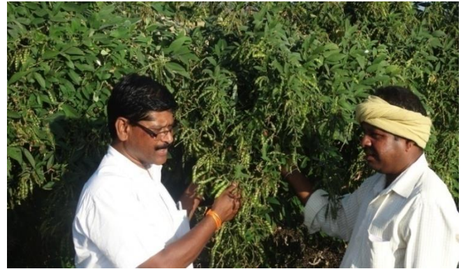
Red gram BRG - 2 distributed to Isoor village