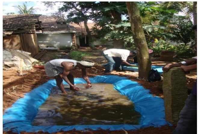
Introducing Azolla as cattle feed