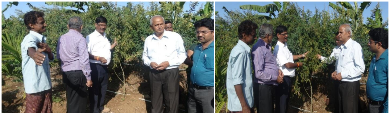
Hone'ble vice chancellor visit to the IFS